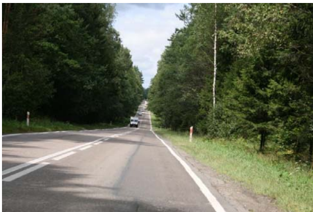
Katrynka – Przewalanka section of road no. 8 – planned for upgrade. Picture taken inside the Natura 2000 site.