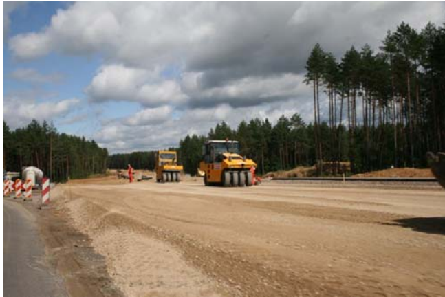
Białystok-Katrynka section of road no. 8 - under upgrading. Picture taken inside the Natura 2000 site.