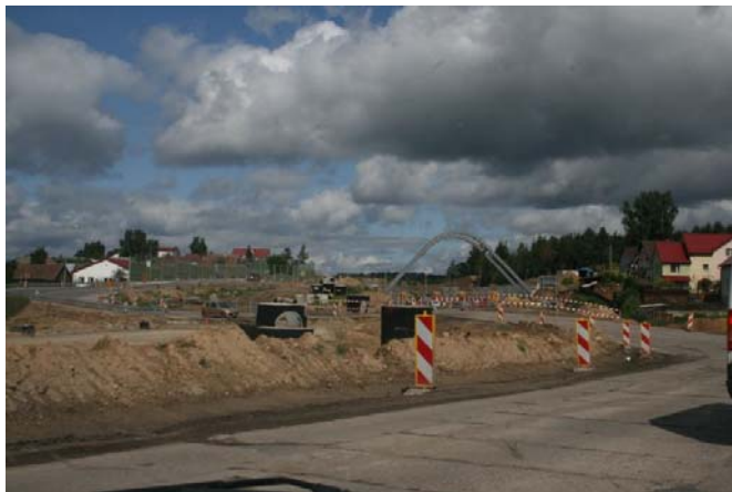
Białystok-Katrynka section of road no. 8 - under upgrading. Picture taken outside the Natura 2000 site.