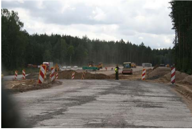
Białystok-Katrynka section of road no. 8 - under upgrading. Picture taken inside the Natura 2000 site.