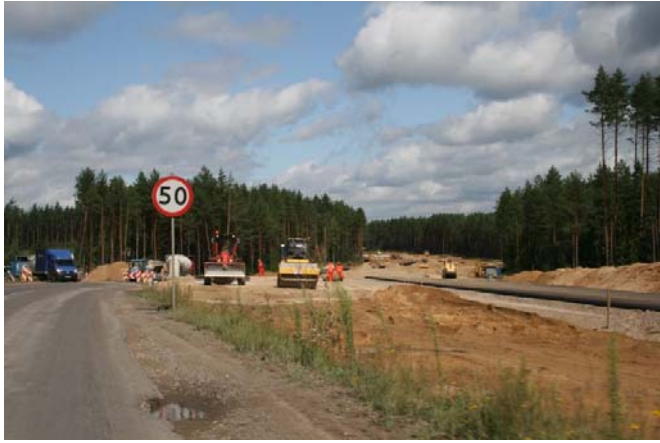
Białystok-Katrynka section of road no. 8 - under upgrading. Picture taken inside the Natura 2000 site.