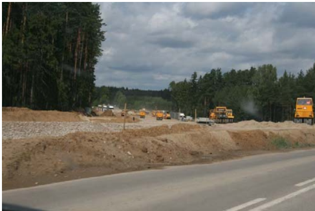
Białystok-Katrynka section of road no. 8 - under upgrading. Picture taken inside the Natura 2000 site.