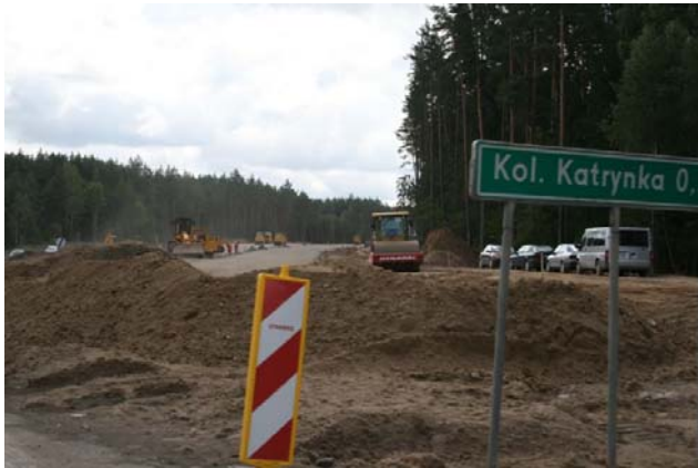
Białystok-Katrynka section of road no. 8 - under upgrading. Picture taken inside the Natura 2000 site.