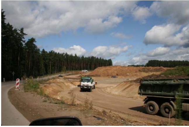
Białystok-Katrynka section of road no. 8 - under upgrading. Picture taken inside the Natura 2000 site, showing construction of the "Sochonie" road junction.