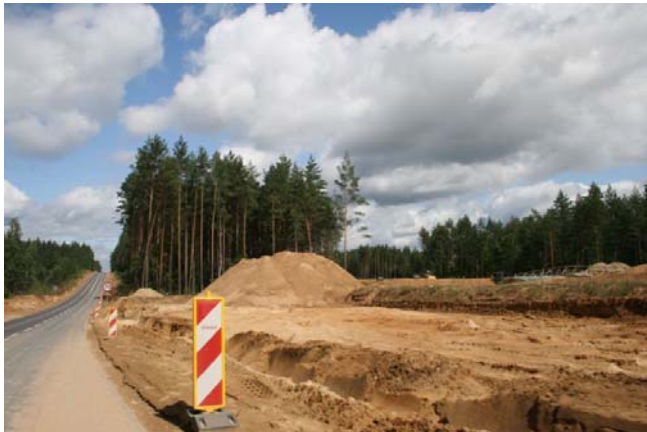
Białystok-Katrynka section of road no. 8 - under upgrading. Picture taken inside the Natura 2000 site.