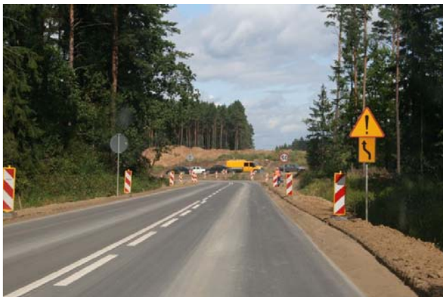
Białystok-Katrynka section of road no. 8 - under upgrading. Picture taken inside the Natura 2000 site, showing the "Sochonie" road junction.