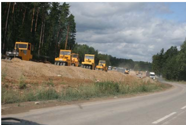
Białystok-Katrynka section of road no. 8 - under upgrading. Picture taken inside the Natura 2000 site.