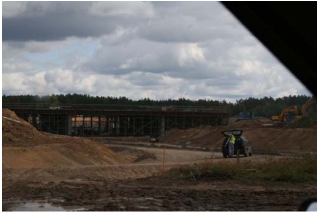
Białystok-Katrynka section of road no. 8 - under upgrading. Picture taken inside of the Natura 2000 site, showing construction of the "Sochonie" road junction construction and the planned connection with Wasilkow Bypass.