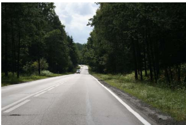
Katrynka – Przewalanka section of road no. 8 – planned for upgrade. Picture taken inside the Natura 2000 site.