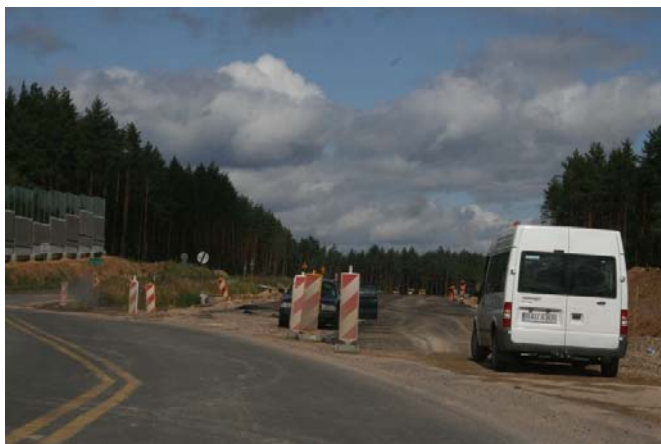
Białystok-Katrynka section of road no. 8 - under upgrading. Picture taken on the boundary of the Natura 2000 site.